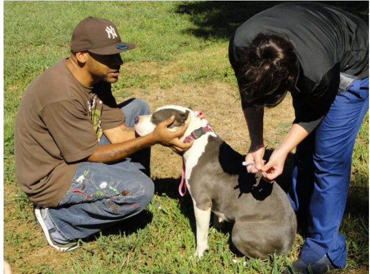
Community Pet Day in Philadelphia, Pennsylvania

They attract "pit bull" dog owners by providing special deals for their dogs and creating an environment where "pit bull" dogs are celebrated and respected.