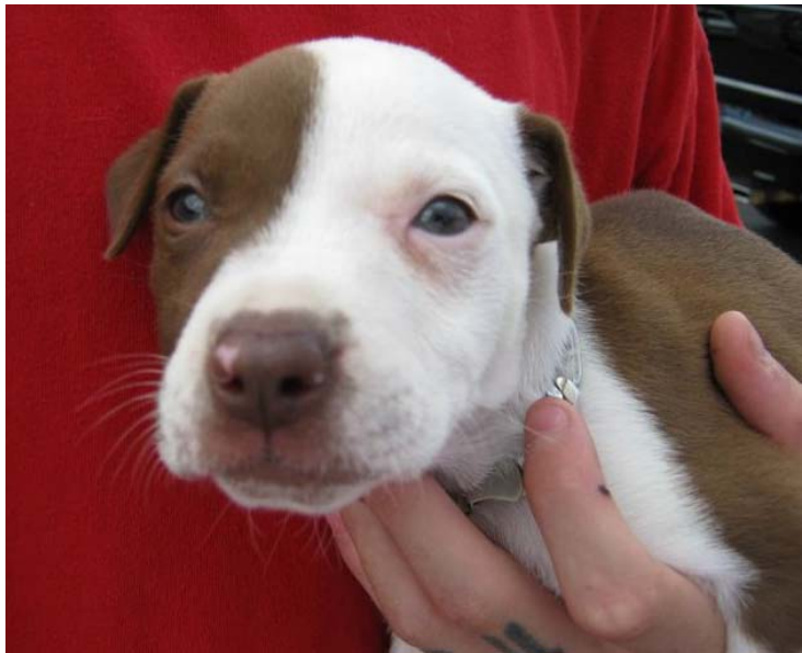
Community Pet Day in Indianapolis, Indiana

A team of volunteers (including a vet or vet tech, if required by state law) provide FREE microchips for "pit bull" dogs and reduced-cost microchips and vaccinations for all other companion animals. Area veterinarians can provide onsite rabies shots at reduced rates or they can distribute coupons for low-cost rabies vaccinations at their nearby clinics.